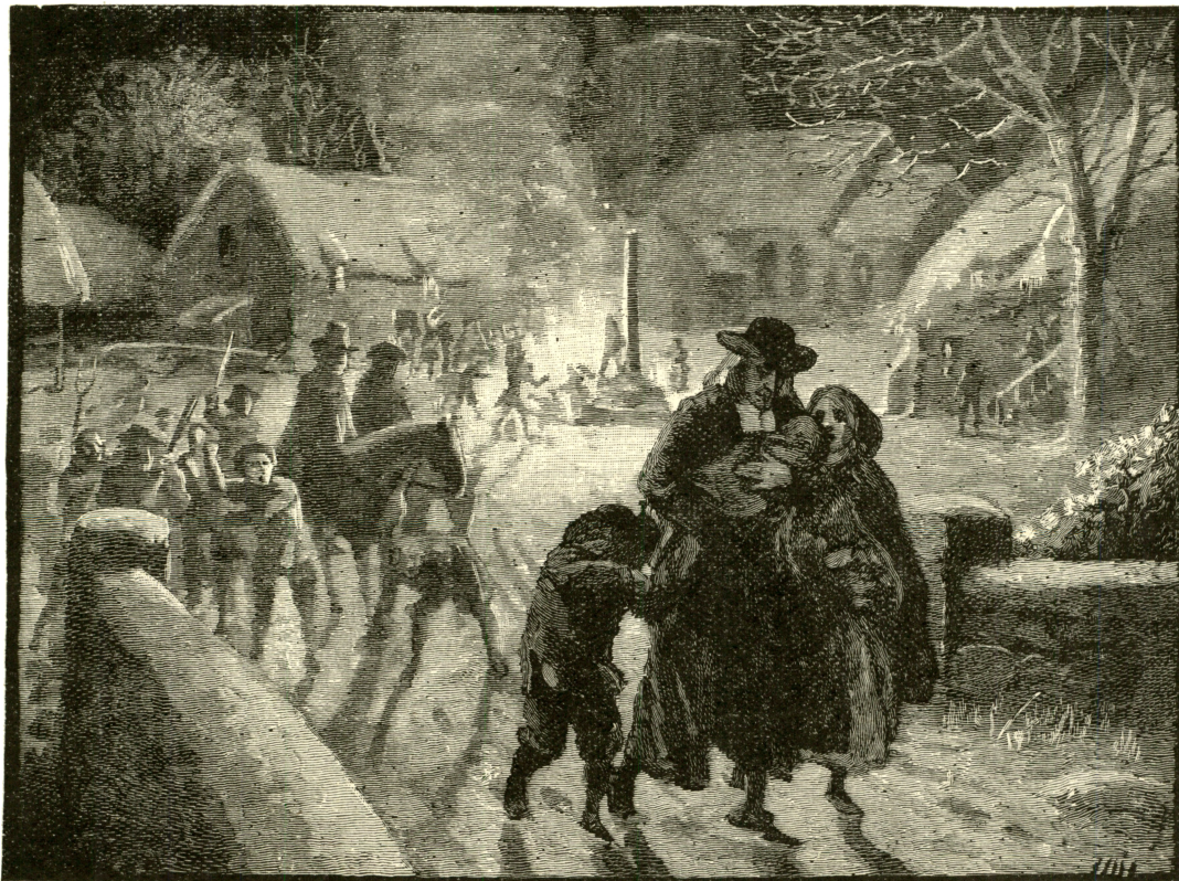
QUAKERS BANISHED FROM MASSACHUSETTS.

It was established, not so much with the view of preserving the Catholic faith, as of perpetuating the integrity of the kingdom. . . . It was, therefore, rather a royal and political, than an ecclesiastical institution." 8